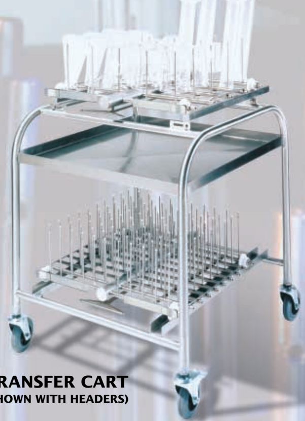
TRANSFER CART (SHOWN WITH HEADERS)