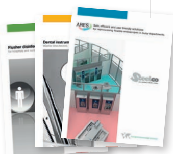
Dental washer disinfectors