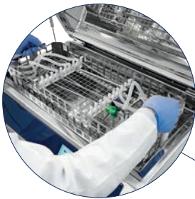
Ultrasonic cleaning systems including units for complex micro-surgery instrumentation.

The first step is understanding your needs and our experienced design department can provide a full consultancy and planning service to support you, from simply replacing a single machine to turning your plans into a facility that exceeds your expectations.