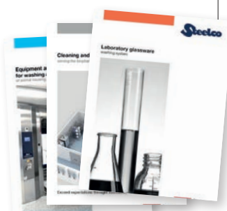
Washing and sterilizing systems for lifescience and pharmaceutical applications