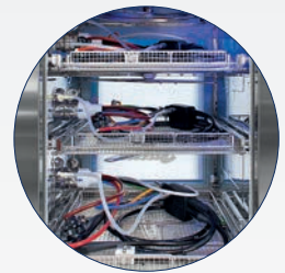
Endoscope reprocessors for up to 3 flexible endoscopes