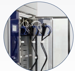
Drying and storage cabinets for up to 18 endoscopes