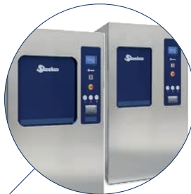
From small to large capacity energy and water efficient sterilizers