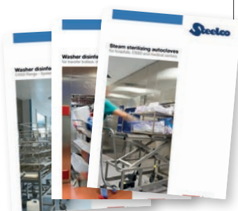
Steam sterilizing autoclaves