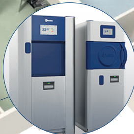
Low temperature VH_2O_2 sterilizers