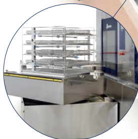
Steelco's range of automation solutions improves department throughput as well as reducing operator work injuries and creates a better working environment.