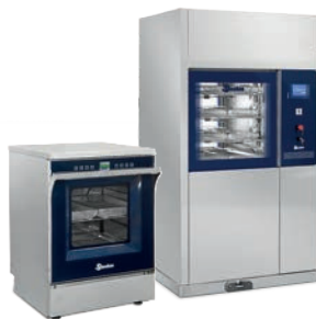
Instruments and washer disinfectors and automations