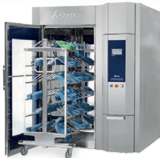
Cart washers with thermal and chemical disinfection