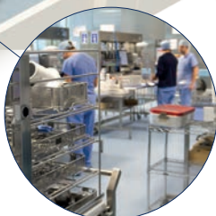
The SteelcoData control system can be linked to most Steelco equipment to provide a comprehensive traceability system as well as remote monitoring of devices.