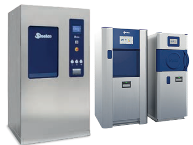
Steam autoclaves and low temperature sterilizers