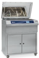
Ultrasonic cleaning systems