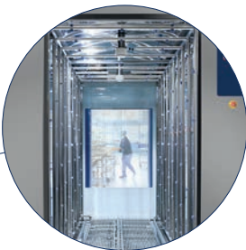
Cart washers in 7 different sizes with thermal and chemical disinfection

Our main product ranges include: Ultrasonic units, washers disinfectors, tunnel washers, cart washers, sterilizers, AERs, drying cabinets and a range of accessories and chemistries.